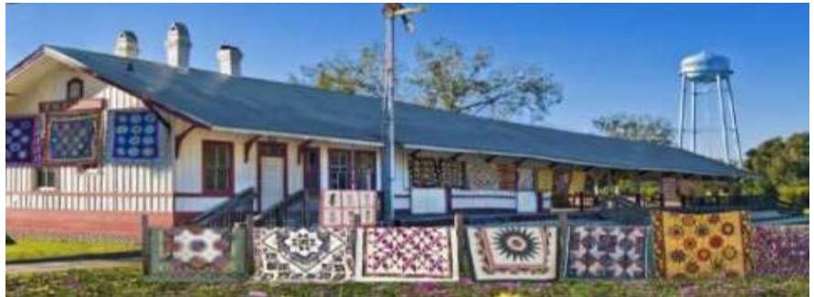
Trenton Quilt & Artisan Festival at the Trenton Train Depot March 19-20, 2022